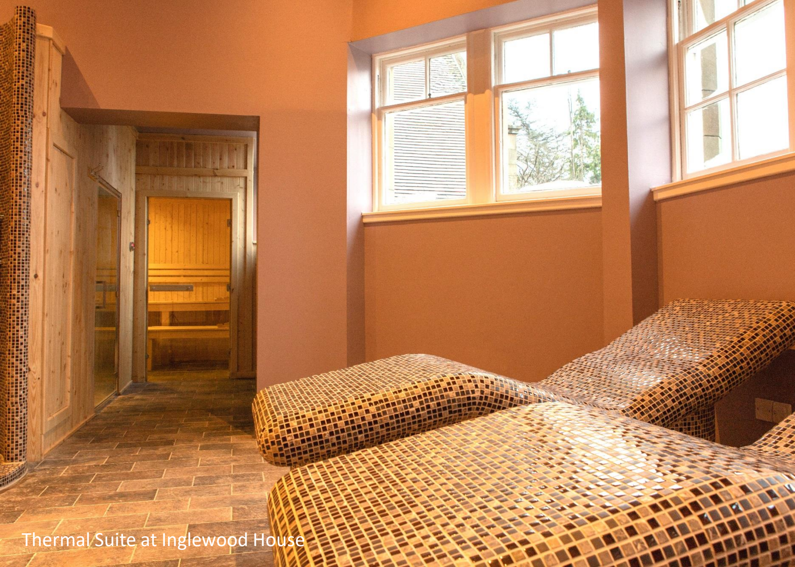
Thermal Suite at Inglewood House